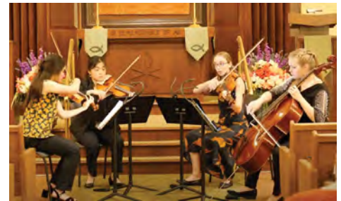
The Bayfield Summer Concert on June 19 featured Madeline Island Chamber Music fellowship quartets with elite student musicians.

members who have a limited ability to travel. All of the presentations had an educational component, with artists explaining their musical performance, original compositions, and artistic backgrounds to the audience.