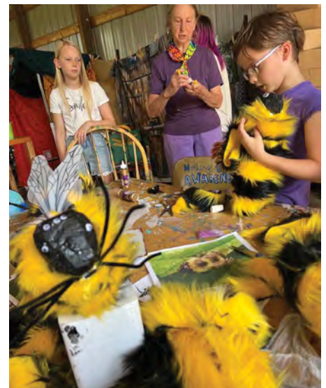
Children ages 7 to 14 learned about the significance of endangered bumblebees and painted, drew, and constructed 3D bumblebees.