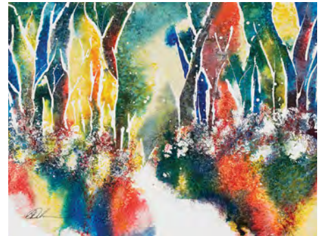
Bev Dehn, "Starlight Walk," watercolor