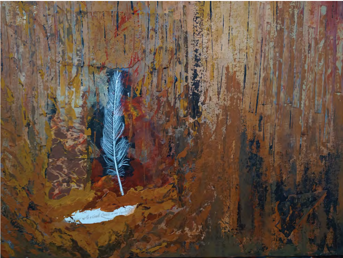
“Listening In,” mixed media, by Kate Miller

Art and Grief both stop time. The Arts in all their various forms can be a vehicle of transformation. One can access the full spectrum of emotion. Therefore, utilizing Art in our process of grief is perfect partnering.