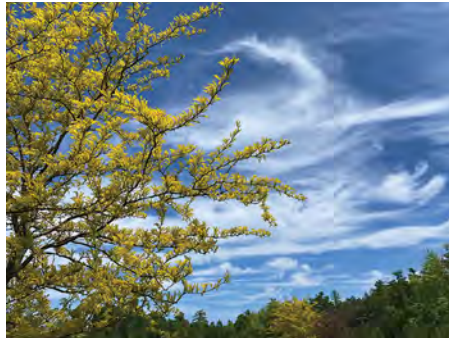
Jill Lorenz, Honey Locust, photograph