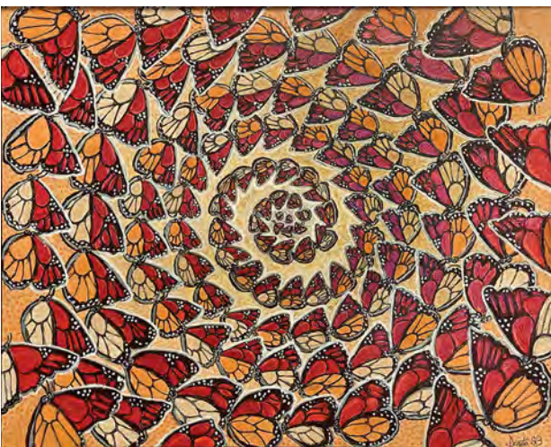
The Washburn Cultural Center, exhibit co-sponsor, purchased Dorota Bussey’s “Sun Dance,” done in acrylic and pen.