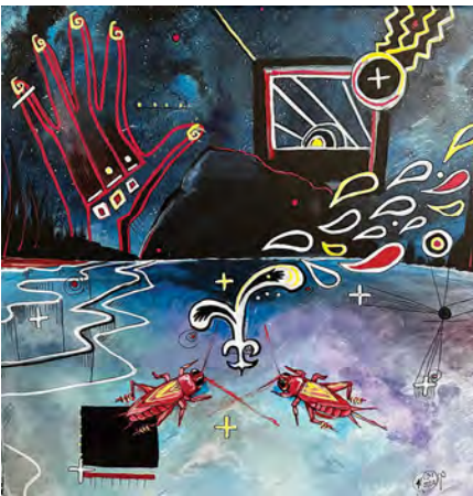
Moira Villiard, "Amidst the Night Orchestra"