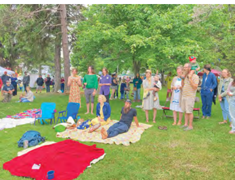
Dandelion Days, the annual spring festival, was held June 24, 2023 and celebrated local ecology and community arts.