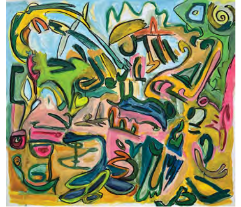
Kelly Ernster, "Island Party," mixed media