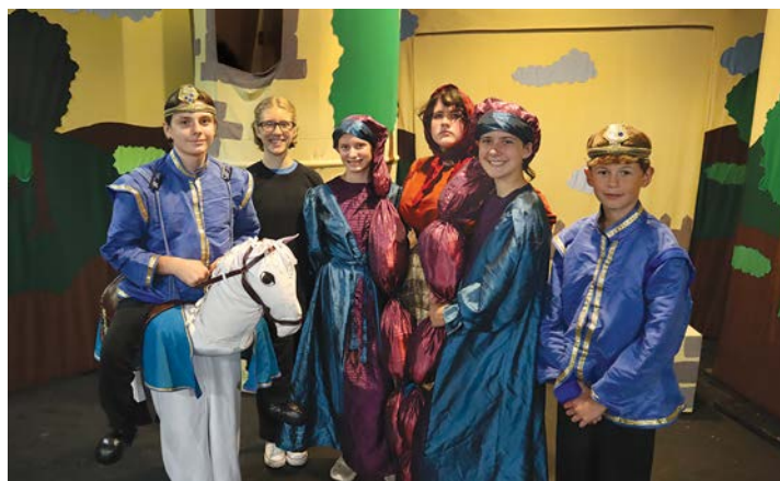
Forty-three children (ages 6 to 15) and 260 audience members at the Chequamegon Theatre Association benefitted by experiencing quality youth theater workshops and performances engaging talented young people.

The most positive outcome of the theater camp was having full-to-capacity audiences share the enthusiastic experience of the children as they produced three performances of Rapunzel. Many children blossomed from hesitant, first-day jitters to confident young performers. The exuberance of the children performing was palpable, as demonstrated by their strong singing, dancing, and line delivery of the characters they portrayed. 🌀