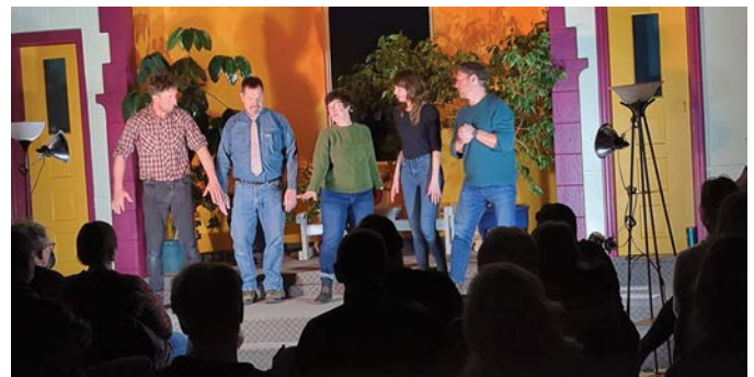
Bringing improv to the Washburn Meditation Center.