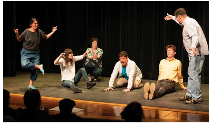
A free performance by Lost In The Woods improv troupe at StageNorth.