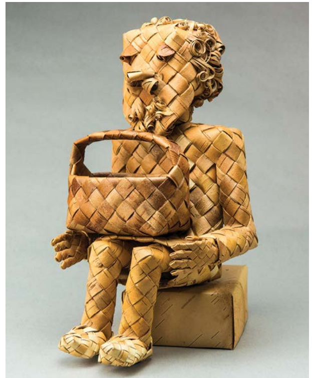
Forest Spirit, Artist unknown, Ukraine

The book will document birchbark art forms but is more: Because of a warming climate and harvesting practices, birch trees are showing signs of stress, and there are 50% less birch trees than 30 years ago. The book includes information on sustainable practices for gathering birchbark and maintaining the health of the trees into the future. ☺