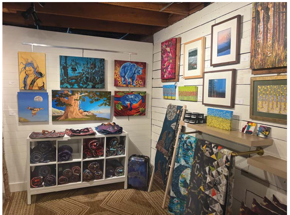
Rabbit, Bird & Bear found its first home in May 2023 in Cornucopia at the Ehlers General Store.

In early June 2024, we have plans to move into the Washburn Cultural Center's first-floor antique store space