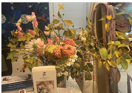
At their new location in Bayfield, RBB will partner with South Short Botanicals.

"I want to support emerging artists and create spaces that showcase work not always found in other galleries."