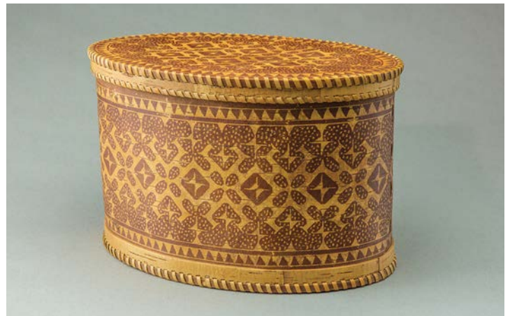
Etched Oval Box, Artist unknown, Russia