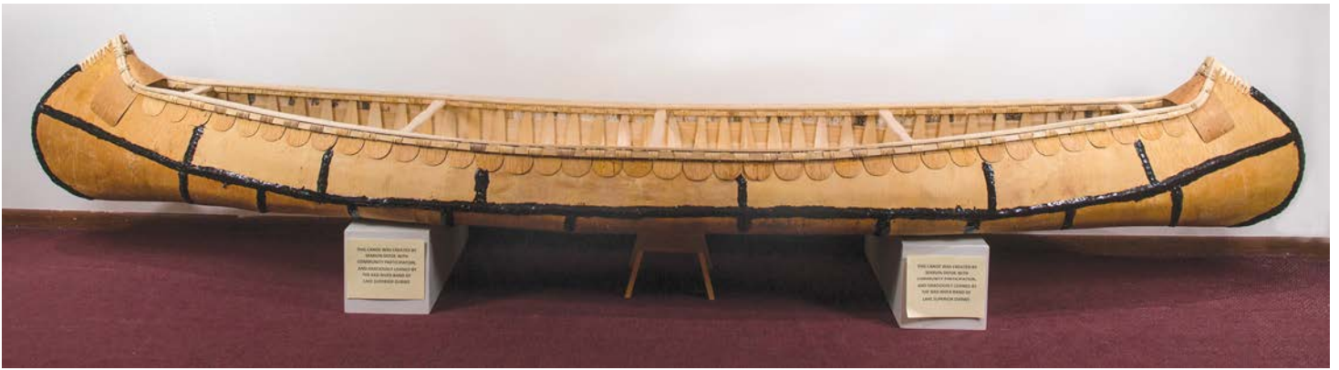
Birchbark art forms to be included in Lorraine Norrgard's book include: Birchbark Canoe by Marvin Defoe, Red Cliff Band of Lake Superior Ojibwe