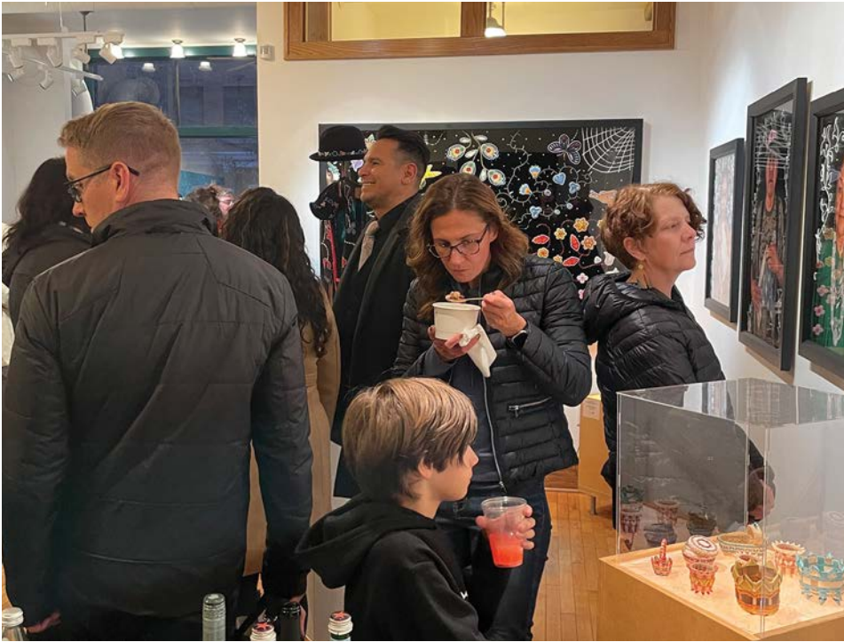
RBB's exhibit in Madison, in partnership with Integrated Arts Group, netted $55,000 for artists.