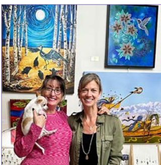
RBB hosts artist "meet and greet" events.

In addition to the WCC first-floor store space, RBB has secured another gallery location in downtown Bayfield at 222 Rittenhouse Ave. We plan to open this spring and have a grand opening in May. We are excited to partner with South Shore Botanicals which will keep Bayfield and surrounding areas supplied with local flower arrangements all summer long!