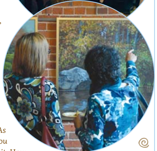
◀▲ Scenes from the “The Gathering” 2010