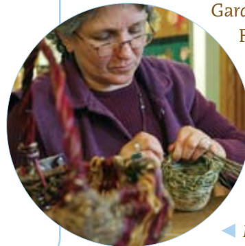
← Participant in the Basketry class

For complete details, visit their website: www.bayfieldartsweekend.com