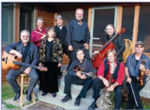
Blue Canvas Orchestra and Singers ▲