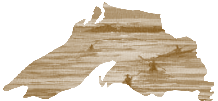
Inland Sea Kayak Symposium • JUNE 18 - 21, 2009 • www.inlandsea.org

Jan Wise will also lead a course at the Symposium, where she'll coach participants in observing color, light, texture and spacial relationships. For more details or to register, log onto: www.inlandsea.org .